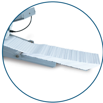
Telescoping Conveyor System Extends from 14" to 36" in length and holds up to 500 folded pieces