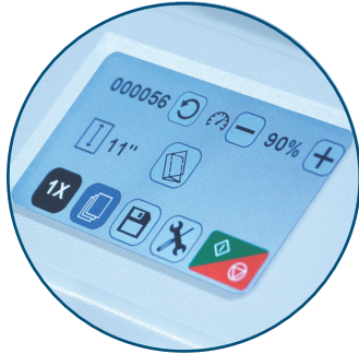
Color Touchscreen Control Panel Utilizes easily-recognized symbols in place of text

The Automatic FD 386 Document Folder folds up to 17,000 pieces per hour! Fully automated fold plates provide one touch set-up of the 18 pre-programmed or 27 custom folds that can be stored into memory. The FD 386 folds up to 500 sheets in as fast as 2 minutes and holds the folded pieces on its patented Telescoping Conveyor System with adjustable stacker wheels . The large full-color touchscreen control panel allows operators to walk up and start folding with little to no instruction. The optional patented Multi-Sheet Feeder allows up to 4 stapled or unstapled sheets to be folded at one time. The FD 386 can also be combined with the optional V-Stack36i Vertical Stacker , which stacks up to 22" of folded documents.