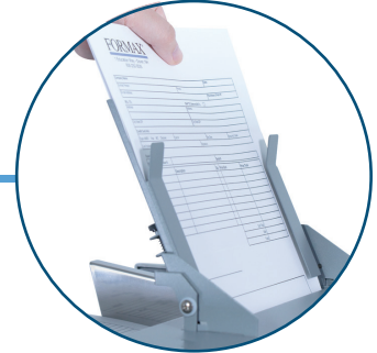
Optional Multi-Sheet Feeder Up to 4 stapled or unstapled sheets can be folded at once