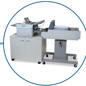
Optional V-Stack36i Vertical Stacker Aligns with outfeed to vertically stack up to 22" of folded documents for further processing